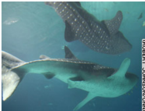
The new aquarium is the first in North America to attempt to keep whale sharks in captivity.

The new aquarium is the first in North America to attempt to keep whale sharks in captivity. Okinawa Expo Aquarium in Japan has kept 16 whale sharks over the past 10 years. Many died young. The longest surviving whale shark at the Okinawa aquarium arrived in March 1995.