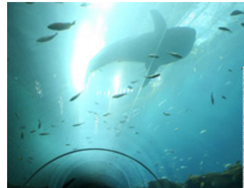
Enormous tanks that sprawl and curve give visitors the chance to virtually dive into the fishes' world.